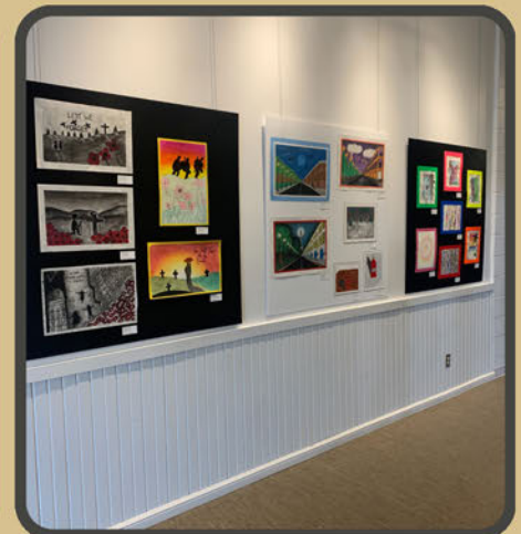
Students at The Gallery Art Exhibit