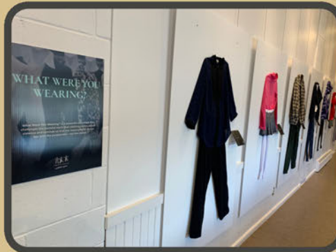
What Were You Wearing Exhibit, sponsored by Violence Prevention East