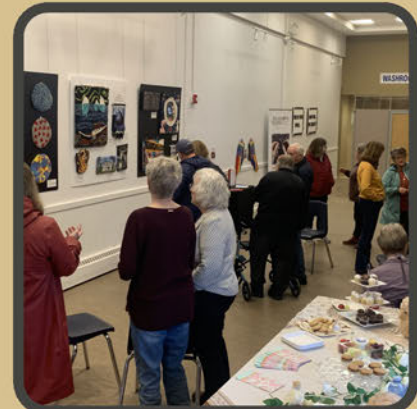
Rug Hooking Guild of Newfoundland and Labrador