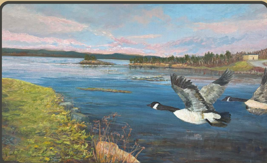
Sanctuary Artist: Rusty Drover 2024 Judges' Choice