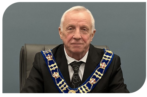
As we start a New Year, let me begin by wishing each and every one of our residents a very happy & healthy 2023

As Mayor, I understand that the past couple of years have been challenging for everyone. But I am also optimistic that 2023 will bring a return to normalcy and our Town will see a period of renewed growth and prosperity.